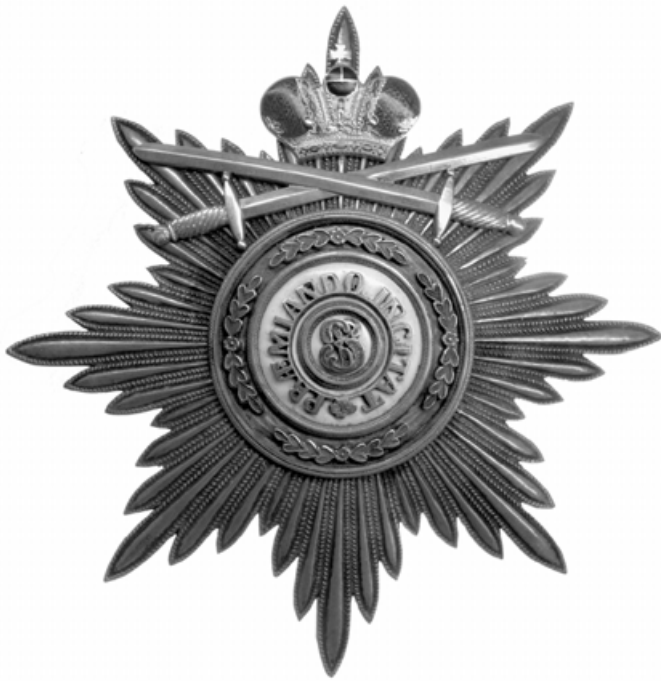
246 Order of St. Stanislaus , 1 st class breast star, by Keibel of St. Petersburg, mid-19 th century, in silver, with gilt and enamel centre and gilt reverse, 92 mm., fitted with later, unofficial additional 'surmounted' swords and Imperial crown, extremely fine £500-700